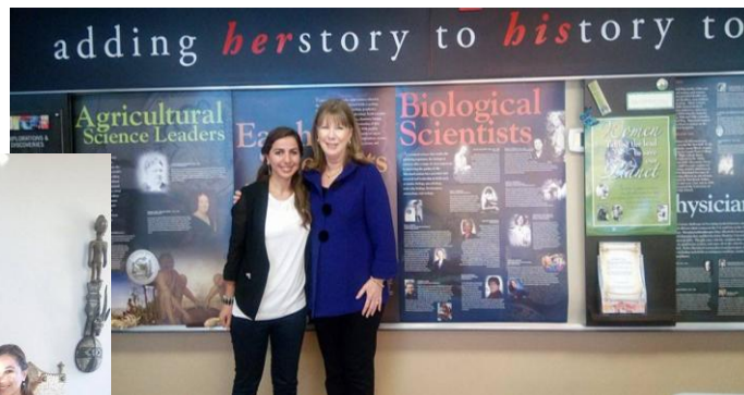
With Commissioner Doris Ligon at the African Art Museum of Maryland