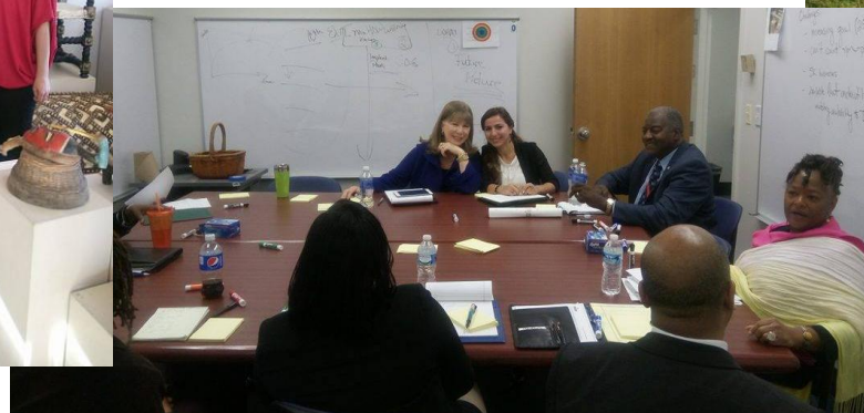
At DHR headquarters strategic planning session